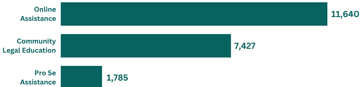
Number of People Benefitted from Other Services